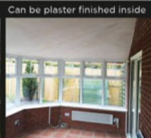
Can be plaster finished inside

Strong people stand up for themselves, but stronger people stand up for others.