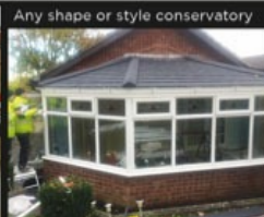
Any shape or style conservatory