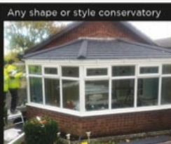
Any shape or style conservatory