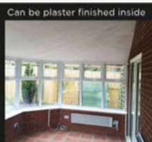
Can be plaster finished inside

The latest time for entries to the June Signpost is Tuesday the 15th of May at 6:00 p.m.