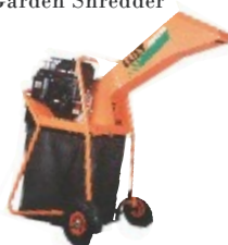
Elite Maestro Petrol Garden Shredder