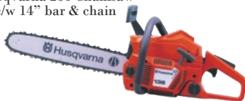
Husqvarna 236 Chainsaw c/w 14" bar & chain