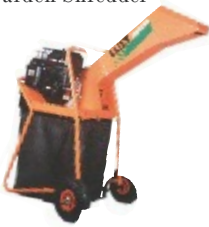
Elite Maestro Petrol Garden Shredder