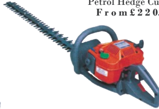
Petrol Hedge Cutters From £220.00