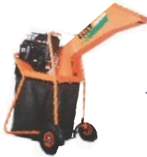
Elite Maestro Petrol Garden Shredder