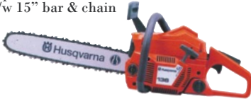
Husqvarna 235 Chainsaw c/w 15" bar & chain